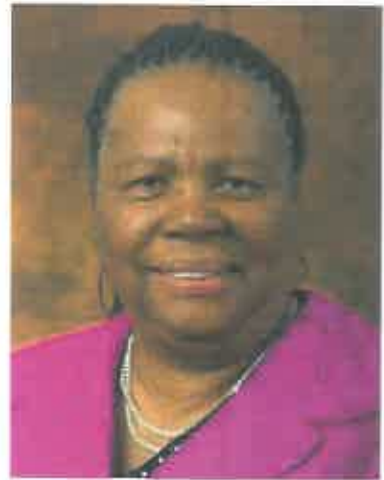
Minister of Higher Education and Training Mrs Grace Naledi Mandisa Pandor

The NSDP and the new SETA Landscape will be ushered in on 1 April 2020. This new dispensation will bring about changes with regards to the leadership and governance in Skills Development. SETAs will remain an authoritative voice of the labour market and experts in their respective sectors. For the country to achieve high levels of economic growth and address unemployment, poverty and inequality, social partners must work together to invest in skills development in order to achieve the vision set in the NSDP of an educated, skilled and capable workforce for South Africa.