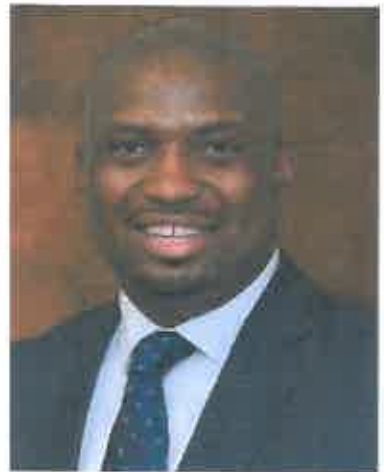
Deputy Minister of Higher Education and Training Mr Buti Manamela